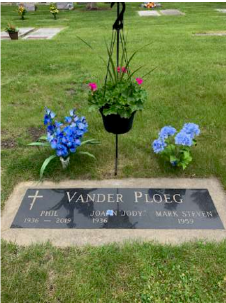
Sadly lost my best friend and love of my life in 2019.